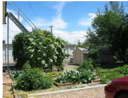
The Mentor's Garden at Rainbow House in Fort Morgan.