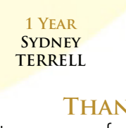
1 YEAR SYDNEY TERRELL